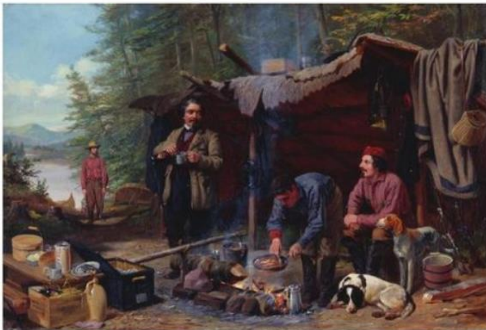
A Good Time Coming, 1862 by Arthur Fitzwilliam Tait (American, 1810-1905) oil on canvas, 20 x 30 inches Adirondack Museum

SIDE-BY-SIDE WITH GUN & DOG Museum exhibition on view until March 20, 2016