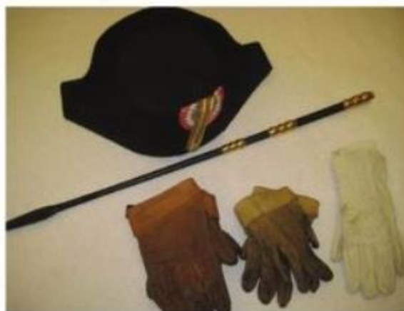
Hat, riding gloves, and whip of the Cadre Noir. Collection of the Institut Français du Cheval et de L'Équitation.

The loan objects are on view in the Library foyer at the NSLM, along with several books from the Main Reading Room and the F. Ambrose Clark Rare Book Room.